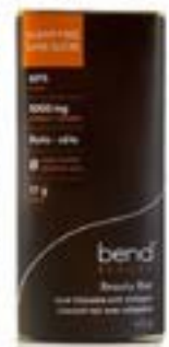
BEND BEAUTY The Beauty Bar ® Sugar Free Dark Chocolate with Marine Collagen, $7.50, bendbeauty.com

If you're as much of a chocolate as we are, you're going to love this! The first sugar-free chocolate bar infused with collagen peptides and soluble fibre is now available from Canadian company Bend Beauty. Totally free of sugar alcohols and high in cocoa polyphenols, this bar is the perfect anytime treat.